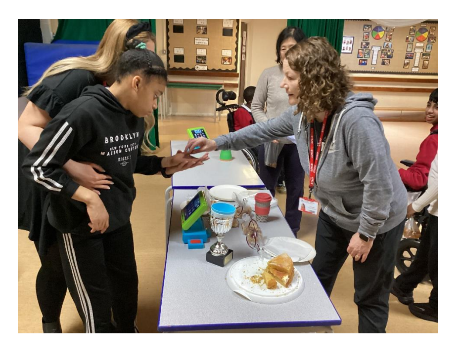
KS3 Semi Formal Pathway Cake sale