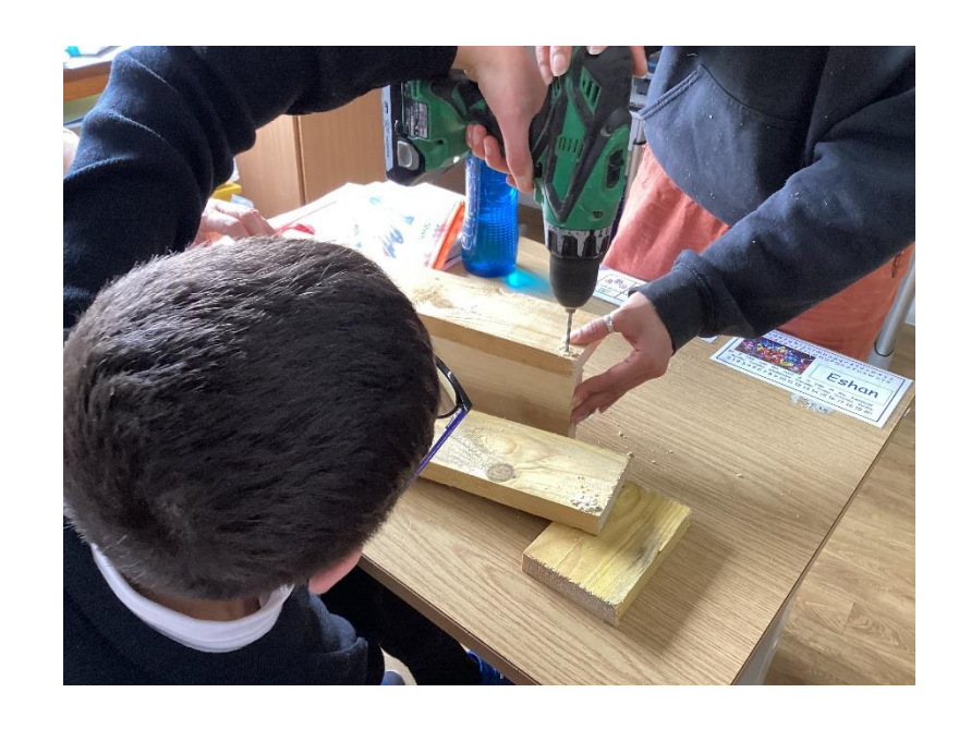
KS 4 Formal Pathway: Making planters to sell at the Summer Fayre